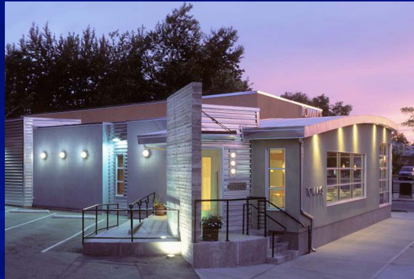
Tommy's Thai 2005 Design Award