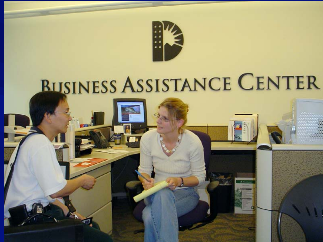
Denver Business Assistance Center