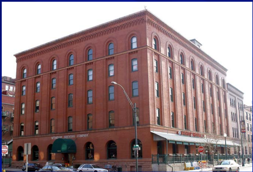
Wynkoop Brewing Company