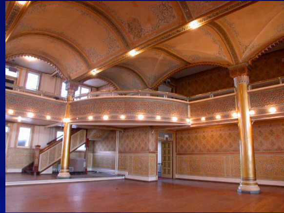
1770 Sherman Events Center