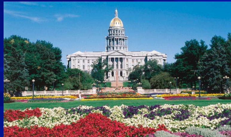
Colorado State Capitol