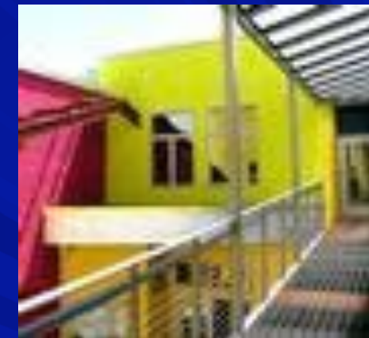
Nine10Arts 2006 Design Award